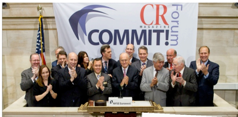
COMMIT!Forum 2011 Executive Summit delegates ring the closing bell of the NYSE